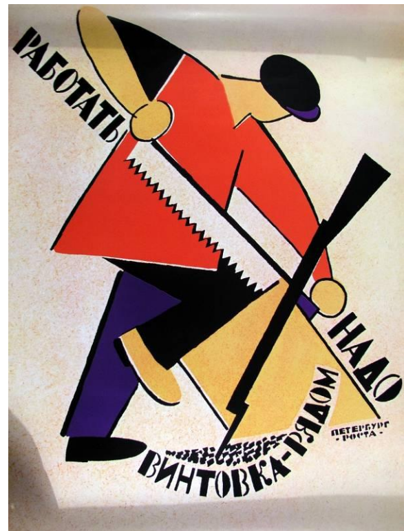
“You must work with a rifle beside you” Ed2008.1.7 (reproduction)